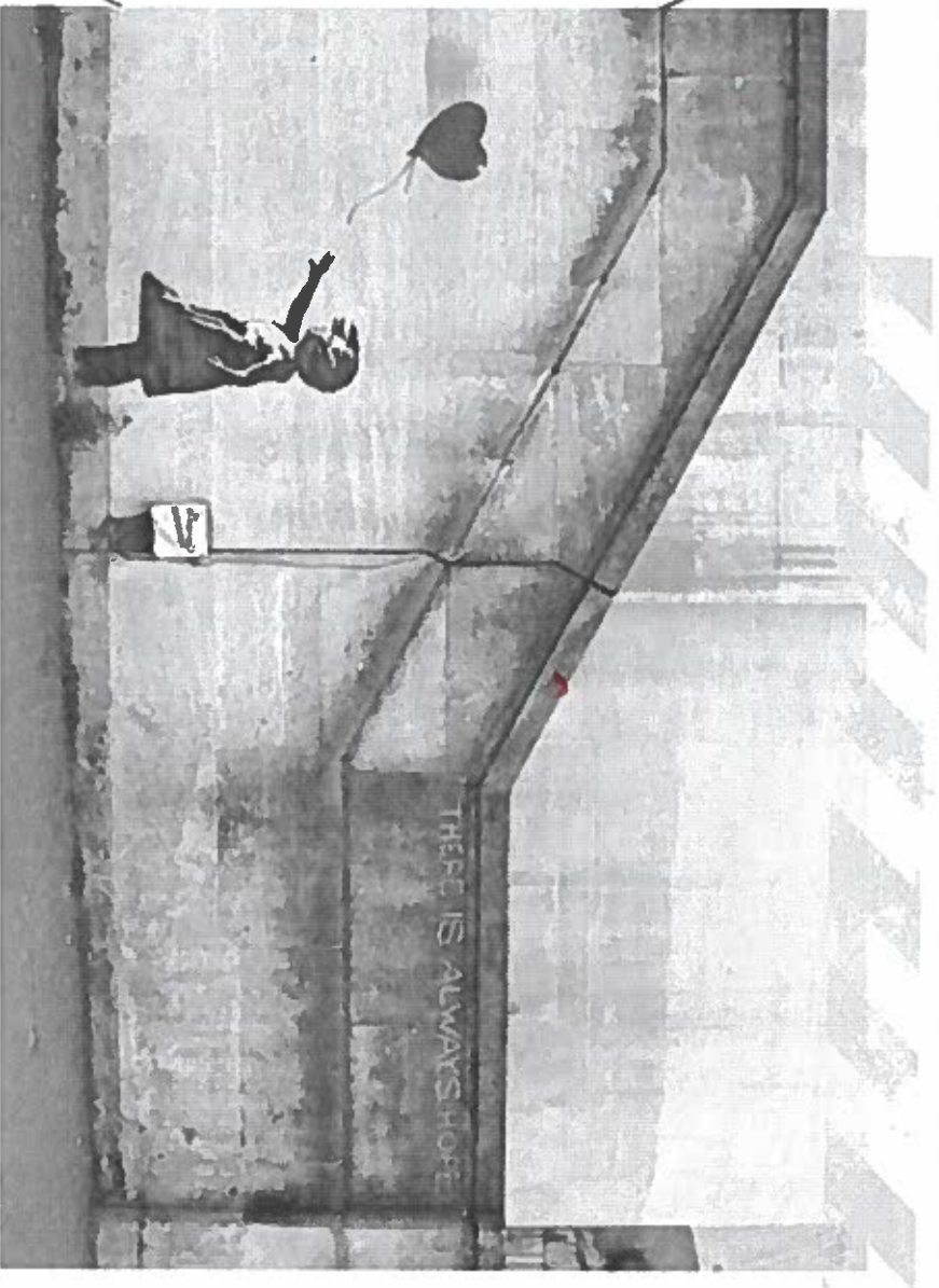
Balloon Girl, by Banksy

Where would you like to make art out in the public? Draw a picture.